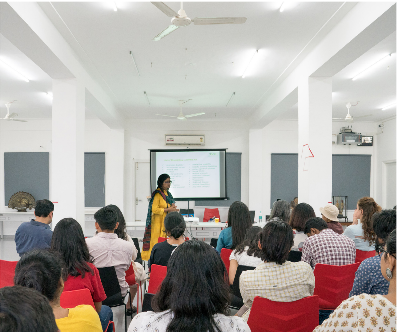
Accessibility - training session in progress