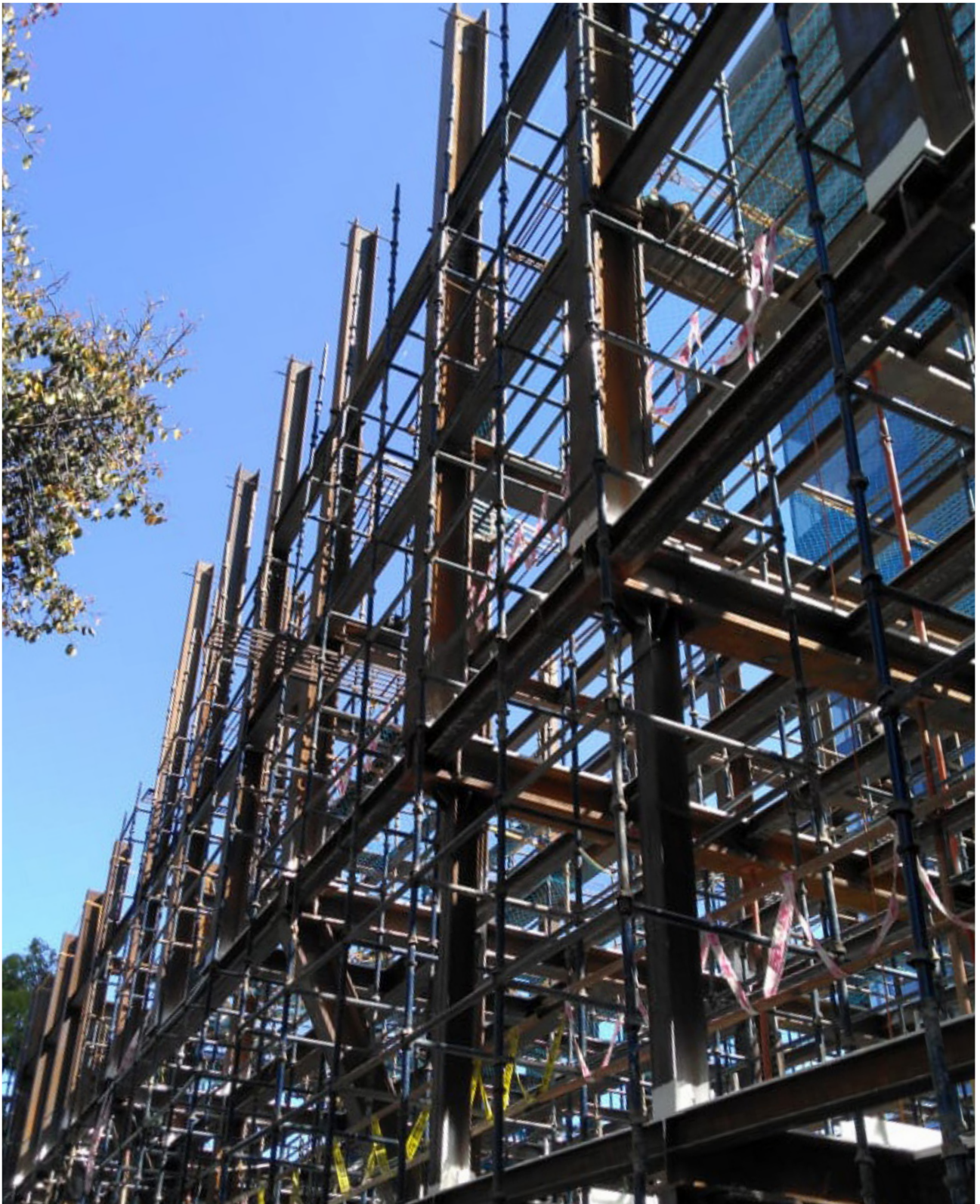
As of date, the structural steel beams and the erection of columns up to the third floor is complete. The fourth floor beams are still under construction.