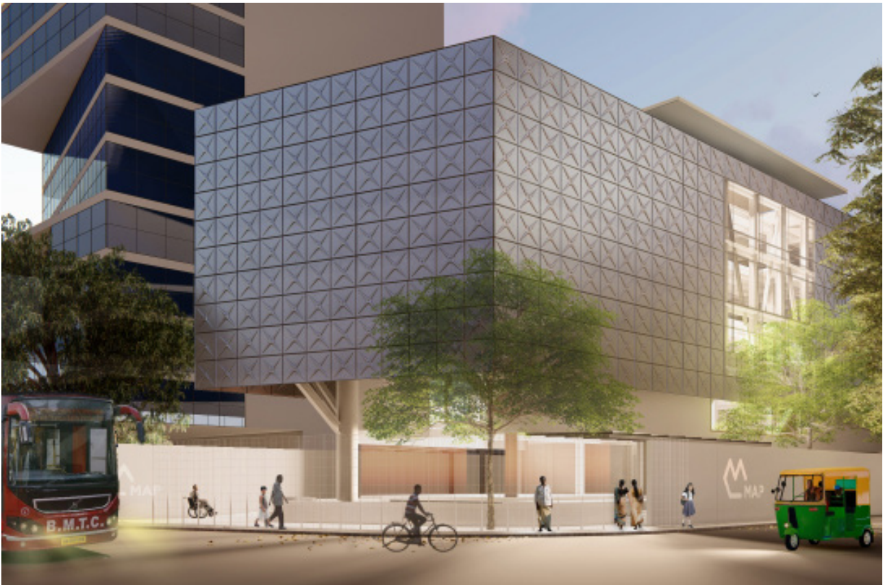
Architect's impression of the MAP building