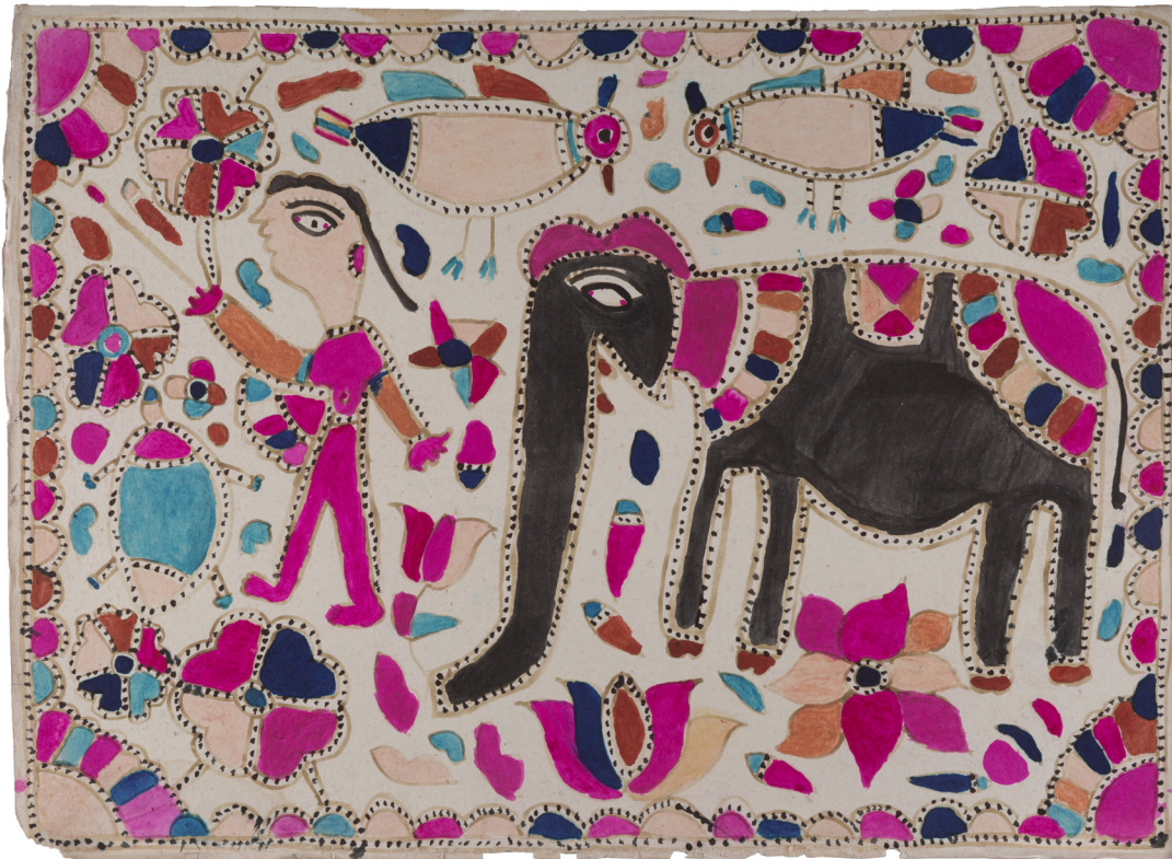
A Madhubani painting titled Boy with Elephant, 1978, Medium: Natural pigments on handmade paper

The MAP Academy's Encyclopedia of Indian Art is focused on making sure a diverse range of communities are included, especially work by folk & tribal artists who are often found missing from previous academic surveys of Indian art history