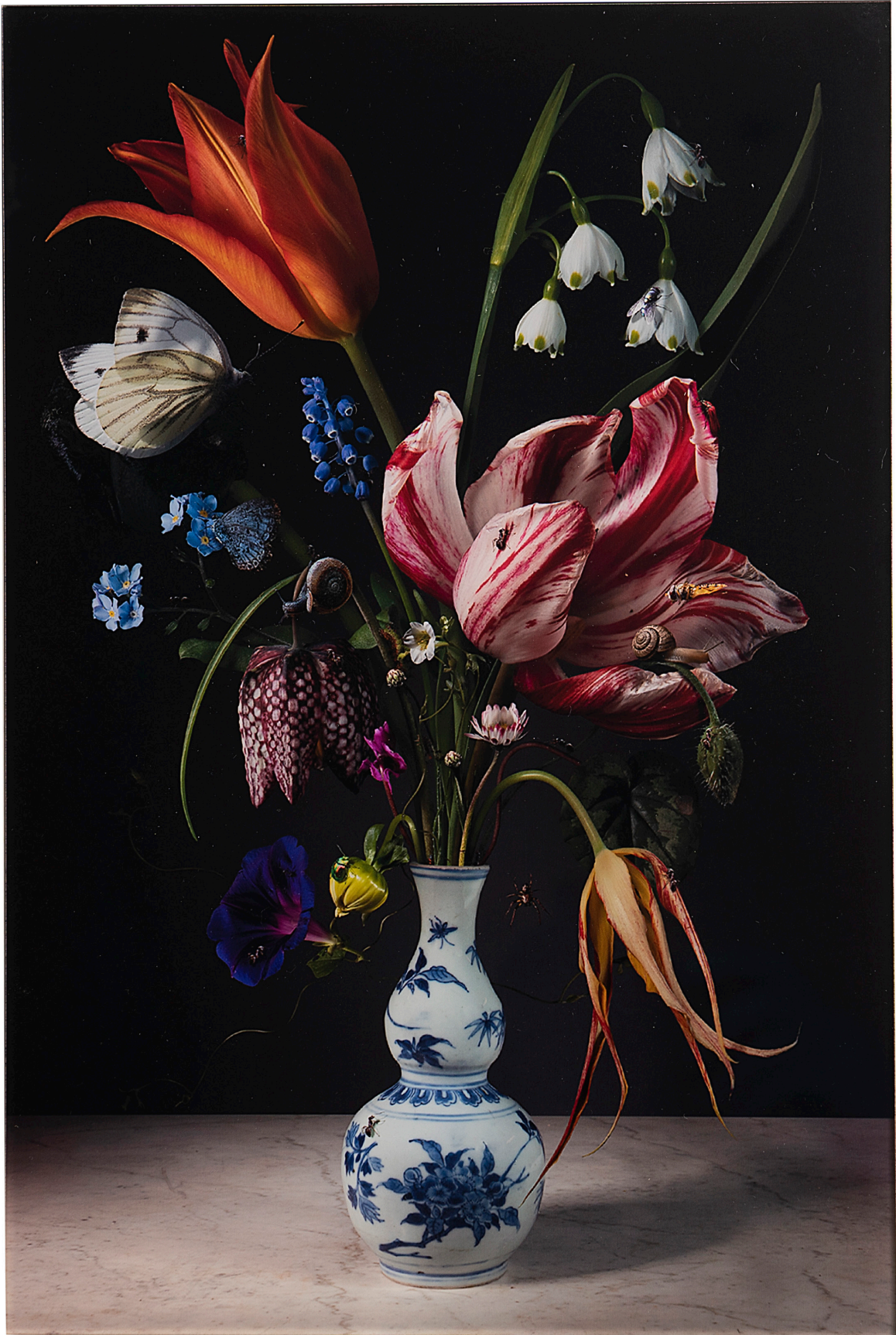
Untitled (#147) from a special edition series of the Flower Pieces, Bas Meeuws, 2018 Medium: Fuji Chrystal Archive on dibond behind Plexiglass