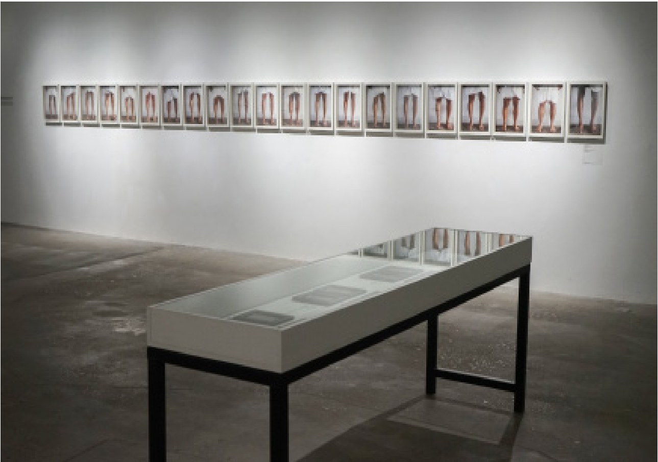
Jimei x Arles - Returning the Gaze: From the Colonial to the Contemporary